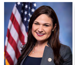
Congresswoman Abby Finkenbauer Iowa-01

Abby is working to improve the underfunded infrastructure in Eastern Iowa and working with the farmers dealing with the ongoing trade war and Trump tariffs effecting their livelihood.