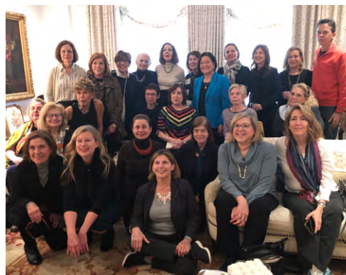
Senator Mazie Hirono - Issues Forum