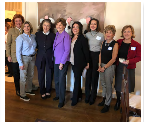
Senator Jeanne Shaheen with PAC Board Members